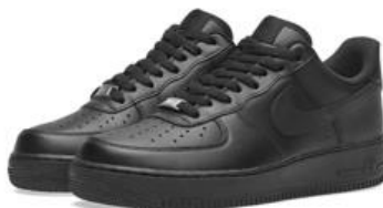
Nike 'Air Force 1'