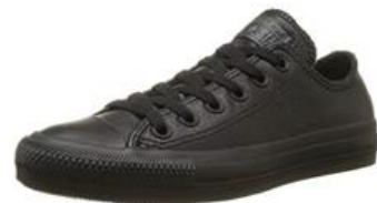
Converse 'All Star'